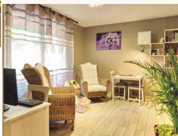
TV and newspapers Lounge