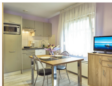
Studio chalet upstairs

We offer you to prepare and book your stay in peace with the cancellation guarantee that allows you for a lump sum of 30 € to cancel your stay without losing your deposit. You can request the full terms of the cancellation guarantee at the reception of the residence or on our website: www.grands-chenes.com .